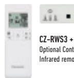
CZ-RWS3 + CZ-RWRT3 Optional Controller. Infrared remote controller.